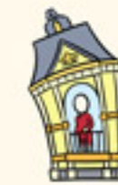
GEORGE WASHINGTON IN NEW YORK