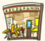
JAMES MCCUNE SMITH