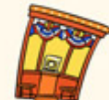
CAST YOUR VOTE