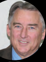
BRANCH BARRETT RICKEY President, Pacific Coast League