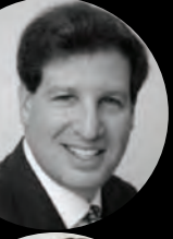
GIDEON ROSE Editor, Foreign Affairs