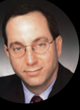
JAY WINIK Author and historian