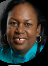
SHARON ROBINSON Educational Consultant, Major League Baseball