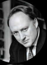
ANDREW ROBERTS Historian and author