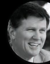
DAVID KENNEDY Donald J. McLachlan Professor of History, Emeritus, Stanford University Co-Director, The Bill Lane Center for the American West