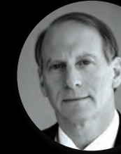
RICHARD HAASS President, Council on Foreign Relations