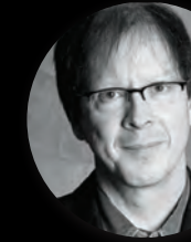
RIC BURNS Documentary Filmmaker