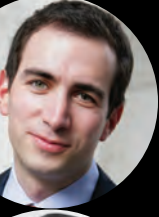
ANDREW ROSS SORKIN Author and Chief Mergers & Acquisitions Reporter, The New York Times