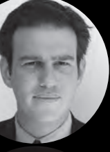
BRET STEPHENS Foreign Affairs Columnist, Wall Street Journal